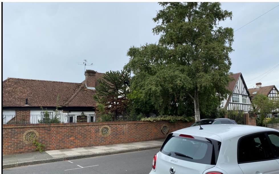
Figure 2 Front of site, with 5 St. Augustine's Avenue to the right