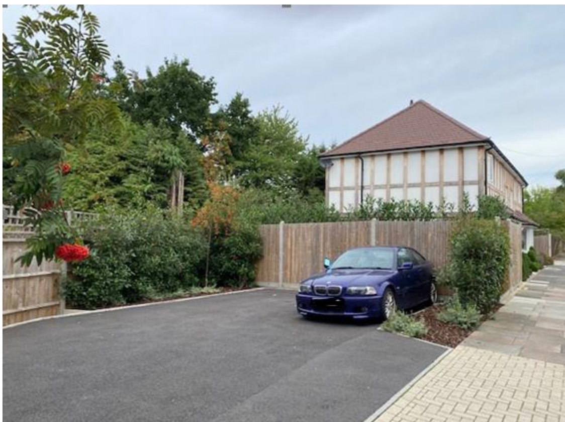
Figure 10 – Car parking arrangement allowed on appeal at Nos. 1A and 1B

7.2.15 Representations have been received stating that the proposed development would not be consistent with the existing character of St. Augustine's Avenue in terms of spaciousness and external appearance. However, taking into account the design of the dwellings, the juxtaposition with existing dwellings to either side and the space maintained between the buildings on the site, and to the neighbouring dwellings, it is not considered that the scope of the development would be significantly out of character with or detrimental to the visual amenities of the area.