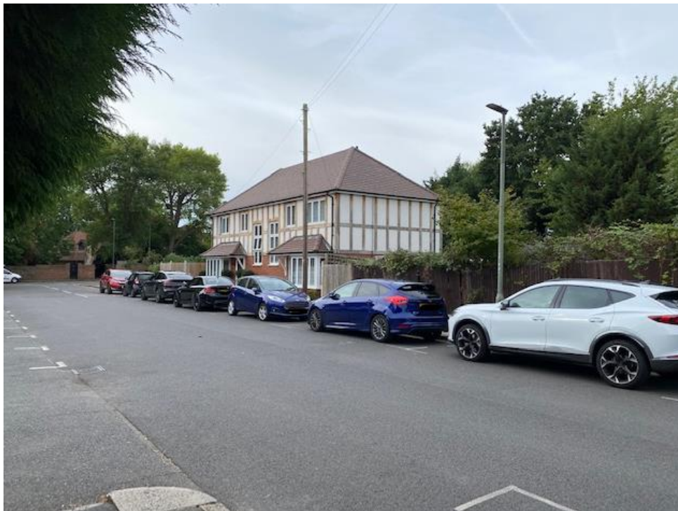
Figure 8 - Nos. 1A and 1B to the south