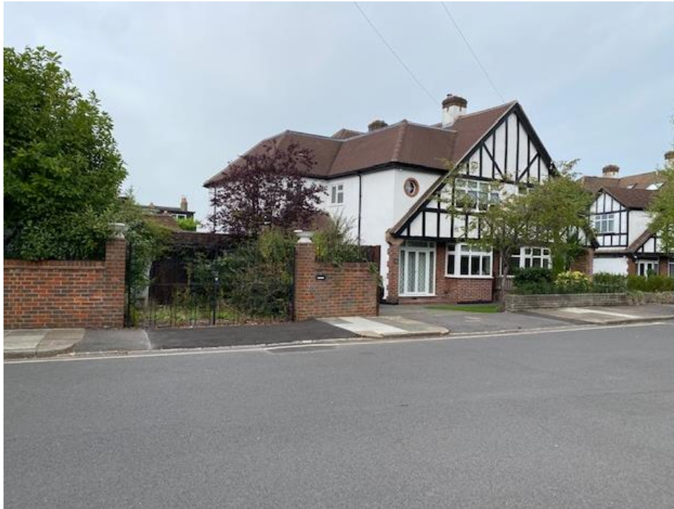
Figure 9 No 5 St. Augustine's Avenue to the north

7.2.14 While the proposed parking area between the buildings would introduce a hard-surfaced gap in the street scene which would not immediately incorporate planting and landscaping of the verdant quality found within the existing street scene, the site plan includes small landscaped areas to either side of the access point which would provide adequate space for softening landscaping to successfully screen the full visual impact of the parking area in the middle of the site as viewed from the street. It is noted that the development allowed on appeal at Nos. 1A and 1B to the south of the site is more exposed and provided less space for frontage softening parking than is the case with the current proposal as a consequence of the more generous space to the front of the proposed buildings.