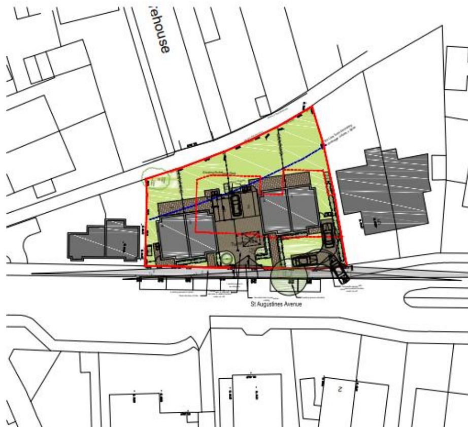
Figure 11 - Location plan showing development in relation to boundaries

7.3.8 Concern has also been expressed regarding the visual impact of the proposal on neighbouring amenity. It is noted that the development lies opposite the library and dance school, and that the front and rear elevations broadly align with and are reasonably separated from neighbouring dwellings to either side. This in tandem with the considerable separation to the rear, to the gardens of dwellings fronting Salisbury Road and the acceptability of the design of the development is considered to result in development that would not have an excessive or detrimental visual impact.