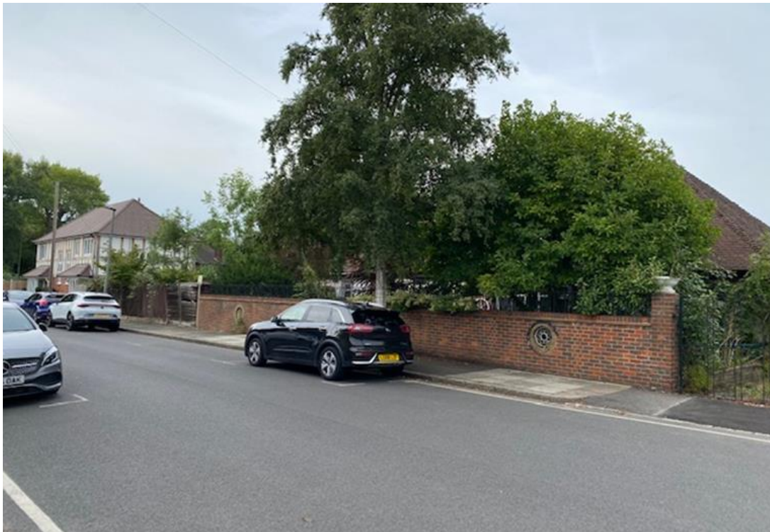
Figure 12 - On-street parking in front of application site

7.5.5 As existing, it is noted that there are 5 full spaces and a short space in front of the site. The revised proposed drawings indicate that the proposal includes the removal of one parking space in front of the site so as to provide the centrally-positioned access to the parking area between the pairs of semi-detached dwellings.