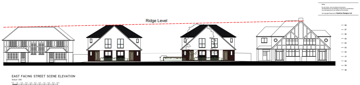
Figure 7 - Proposed street scene elevation

7.2.13 The design of the pairs of dwellings includes shared front gable features with set-back side hipped roof elements akin to the first floor extensions evident within some of the existing dwellings within St. Augustine's Avenue. To the left, the development would juxtapose with the new dwellings at 1A and 1B and to the right, with the dwelling at No. 5. It is considered that the design within this application responds to the appearance of dwellings on either side of the site, bridging in terms of design features the somewhat disparate appearance of the new-build dwellings at Nos. 1A and 1B and the original dwellings to the north.