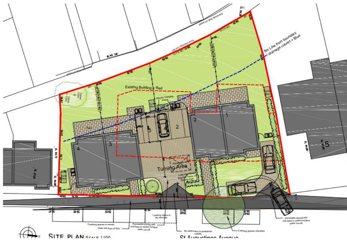
Figure 4 Proposed site plan