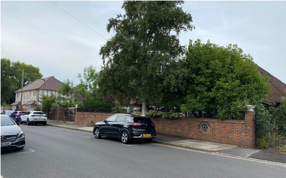
Figure 3 Front of site, with new dwellings at 1A and 1B to left