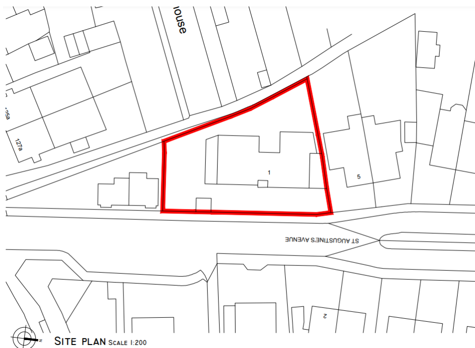
Figure 1 – site location plan